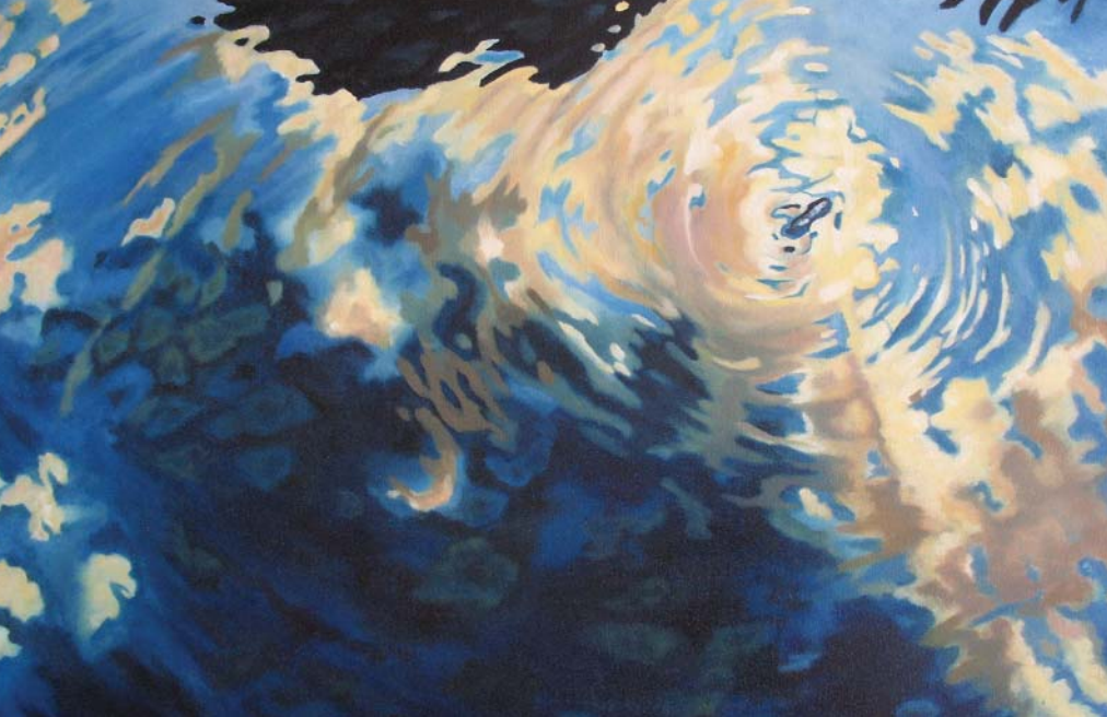
BONNIE SOL HAHN