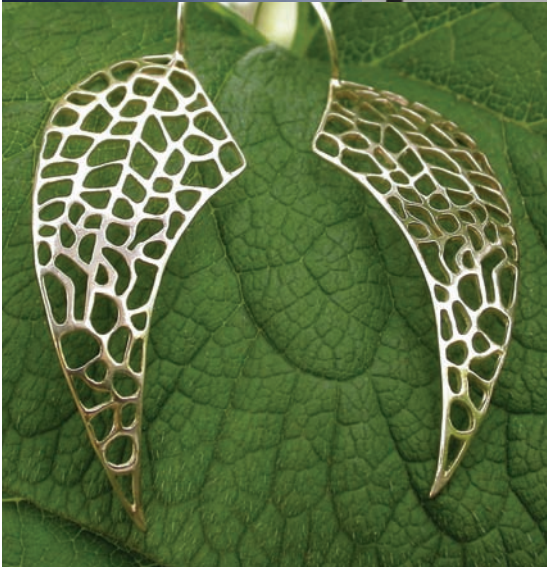
CLOCKWISE: TOP LEFT, ELAINE UNZICKER; KEIKO MITA; TODD NOE; EMILY AMEY